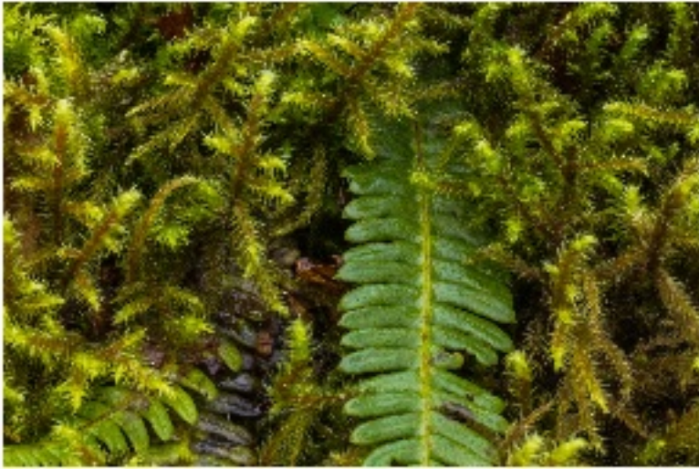
Diversity: the fact that very different people or things exist within a group or place