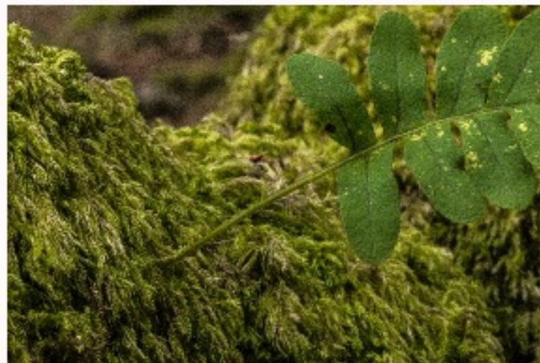
Harmless: a situation in which people live and work not with other people, or in a way that does not damage things around them