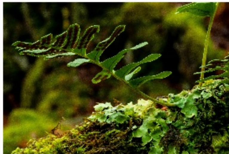
Conspiration - an alliance between people in regard to doing something together which is considered harmful to others