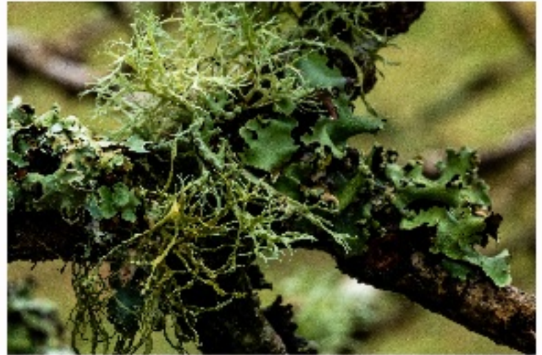
Exchange: a situation in which one person gives to other person something and receives something else of a similar type or value