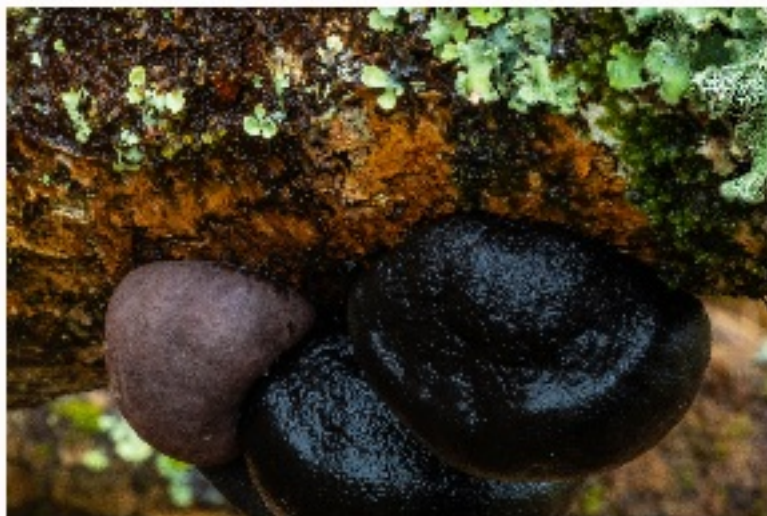
Interdependence: related to one another in such a close way that each one needs the other in order to exist