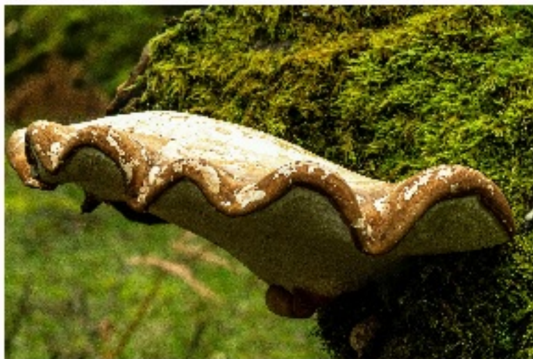
Reciprocal - one according to an arrangement by which you do something for someone who does something for you